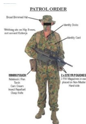
Modern Australian soldier

The uniform is a key element of the Australian Army's identity. Australia changed over to helmets in 1916, before that they wore slouch hats. The main change in World War I was to uniforms that blended with the background due to new long-range rifles and artillery. If you could be seen, you could become a target. Before that, you were pretty safe if you were 300 metres away.