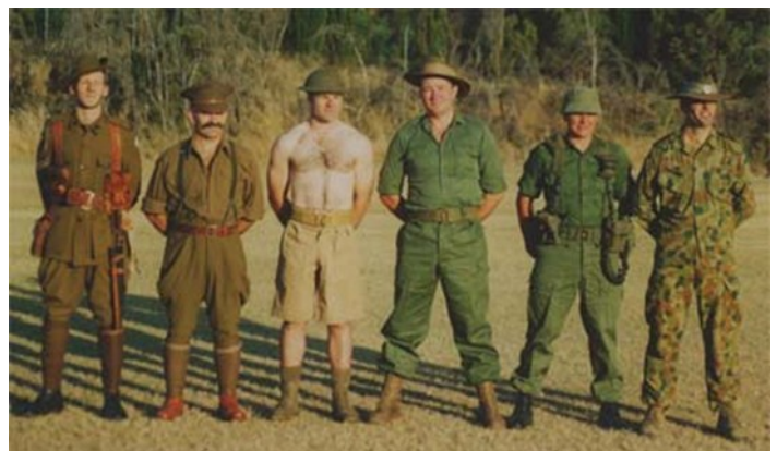
100 years of Engineer Corps uniforms